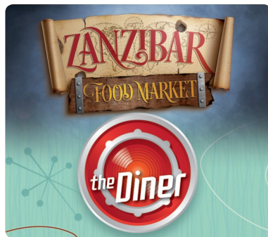
Zanzibar Food Market & The Diner Location: Metropolis & Flamingo 1

Our new Upper Deck champion fish & chip restaurant is located on The Hub's first floor. Serving a selection of truly delicious meals, a children's menu is also available. The restaurant features a giant aquarium and there is an Upper Deck 2 Go takeaway counter on the ground floor too. Vegetarian and gluten free options available.