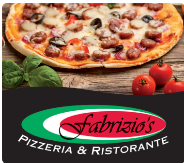
Fabrizio's Pizzeria & Ristorante Location: Flamingo 1

Offering Tex Mex flavours, including steaks, burgers, burritos, tacos and fajitas, here you can also enjoy an English breakfast, milkshakes, cocktails and mocktails, plus a children's menu. Metropolis also features a Pool Table, plus 10 screens bringing you over 250 music videos from the last 4 decades. Vegetarian, vegan and gluten free options available.