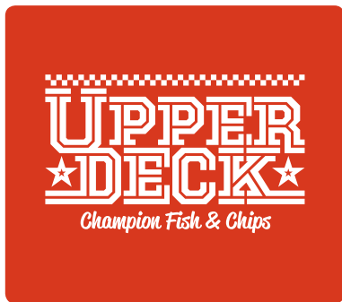
Upper Deck Fish & Chip Restaurant Location: The Hub at Flamingo 1

Fabrizio's All You can Eat Buffet is new for 2019. Offering a delicious buffet of pizzas, pastas, salad and soft drinks for the whole family. You can also enjoy Alfresco Dining in the outside seating area whilst watching the Hero and Navigator rides in action. Vegetarian food choices available.