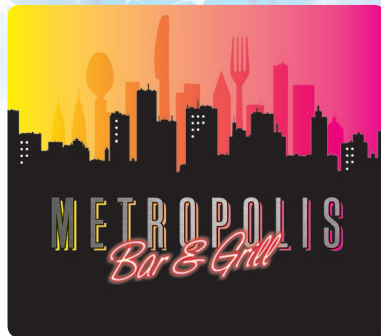
Metropolis Bar & Grill Location: Metropolis

Our family friendly country pub provides indoor and outdoor dining adjacent to Children's Planet. Serving locally sourced ales and home cooked food, its traditional menu includes steak & Yorkshire ale pie and traditional fish & chips, along with delicious vegetarian and gluten free options. A children's menu featuring a colouring-in activity sheet is available too.