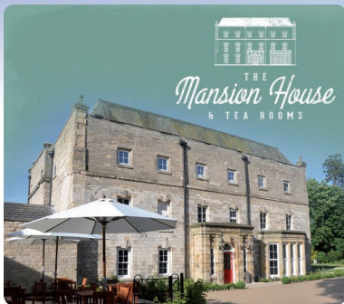
The Mansion House & Tea Rooms Location: Peter Rabbit™ Adventure

Discover traditional English refreshments in our Georgian mansion, right next to the Peter Rabbit™ Adventure playground. Here you can enjoy Taylors of Harrogate fine teas and coffees, accompanied by speciality sandwiches and main meals, plus adult and children's afternoon teas. This venue is available for weddings and private functions.