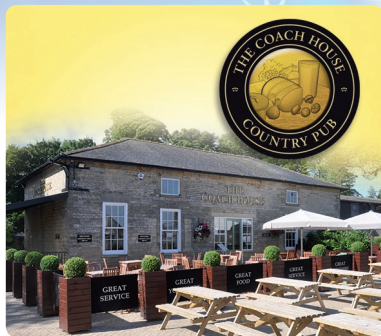
The Coach House Country Pub Location: Children's Planet

Discover traditional English refreshments in our Georgian mansion, right next to the Peter Rabbit™ Adventure playground. Here you can enjoy Taylors of Harrogate fine teas and coffees, accompanied by speciality sandwiches and main meals, plus adult and children's afternoon teas. This venue is available for weddings and private functions.